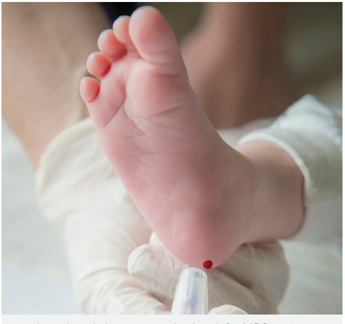
A newborn baby receives a heel stick for NBS testing.

This is critical, as many of the conditions screened for by NBS need to be diagnosed as quickly as possible.